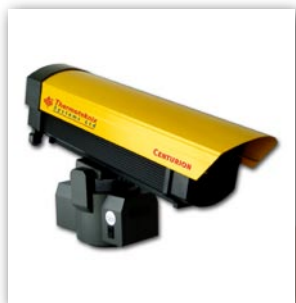
Environmental enclosures, remote focus, motor drive, internal heating/cooling, window purge, wiper