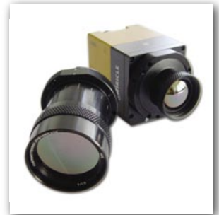
Quickchange AutoID lenses

Not all features present on all models. Specifications subject to change MIRICLE is a registered trademark of Thermoteknix Systems Ltd. Printed on environmentally friendly 100% chlorine free pulp