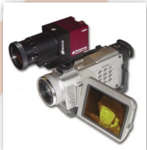
Camcorder compatible connection kit