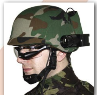
Opti-glass video spectacles & battery pack