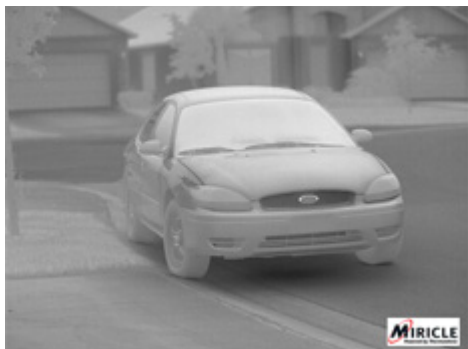
MIRICLE 110K-25μ camera delivers Superb Image Quality