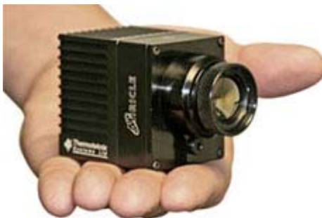
The new MIRICLE® 110KS-25 High Performance Miniature Thermal Imager