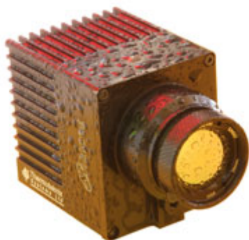
The new MIRICLE® 110KS-25 is a sealed and waterproof infrared camera unit